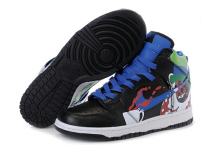
Air Jordan Retro 9 white black red ID:6017 Free Shipping